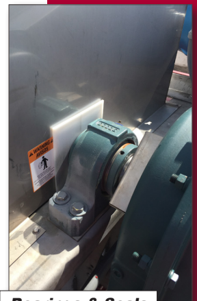
Bearings & Seals