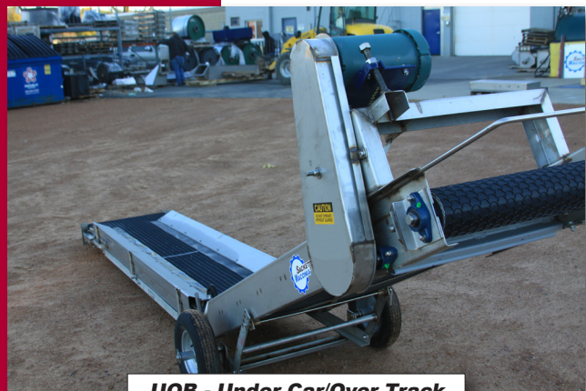
UOB - Under Car/Over Track