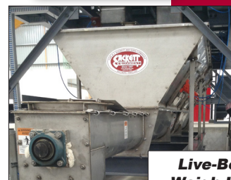
Live-Bottom Weigh Hopper