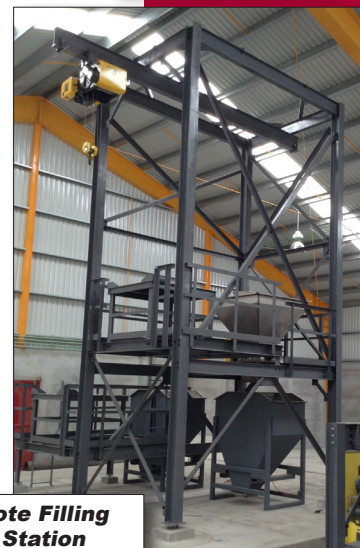
Tote Filling Station