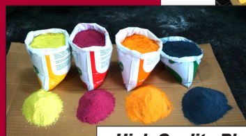
High Quality Blending & Bagging