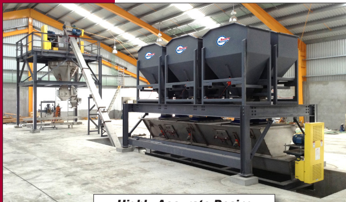
Highly Accurate Dosing