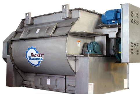
The HIM Mixer